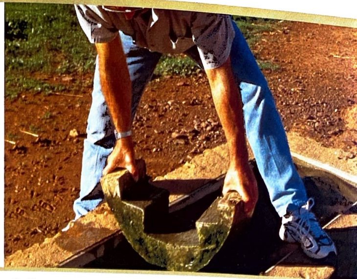
5 Place stones/rocks in troughs to enable crane chicks to climb out