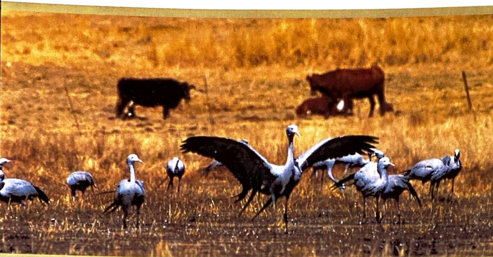
2 Cranes often frequent agricultural lands in which to forage or even nest, exposing them to specific agricultural threats

Cover Cranes are vulnerable to entanglement with livestock fences