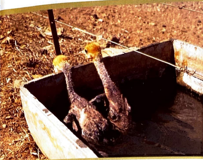
4 Crane chicks can fall into drinking troughs and drown