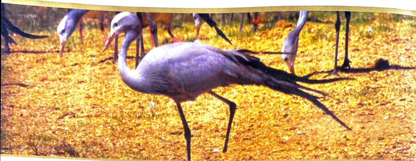
6 Baling twine often becomes entangled in the crane's legs if left lying in the lands

should be kept to a minimum. Nowadays farms are offering accommodation for tourists and use cranes as draw cards – especially if they are nesting. While such eco-tourism is good, disturbance to the cranes at their nest should be kept to a minimum by not approaching so closely that they become agitated and move off. Repeated visits of this nature may lead either to the nest being abandoned, and/or the eggs being taken by predators.